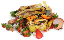
Organic, kitchen, yard and animal waste.

UNACCEPTABLE ITEMS - These items are NOT accepted with your recycling and require alternative handling.