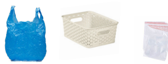
bins or trays, pouches, plastic bags, and toys.