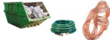
Scrap metal, wires and cables, home and construction waste.