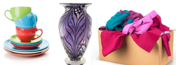
windows, ceramics, and other reusable items.